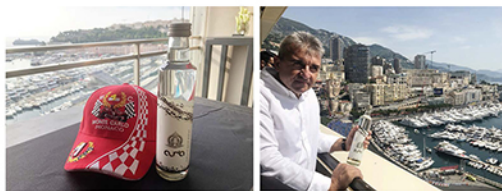
GRAND PRIX MONACO