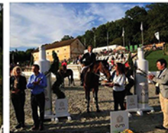
HERNEACOVA INTERNATIONAL JUMPING