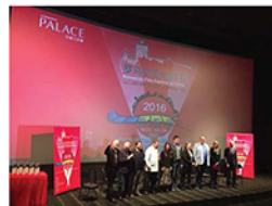
ROMANIAN FILM FESTIVAL - BEIJING