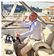
RIVIERA YACHTING RENDEZ VOUS NICE