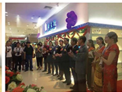
THE 2ND CHINA CEEC INVESTMENT AND TRADE EXPO NINGBO