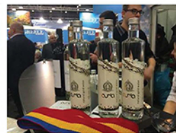
TÂRGUL DE TURISM DIN VIENA